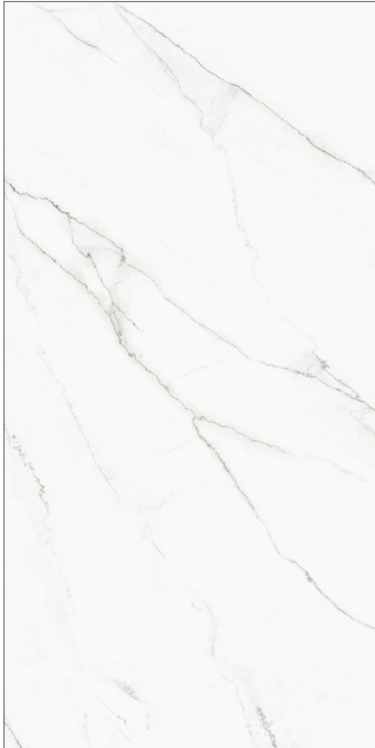
163 x 324 cm (64.17" x 127.56") Polished FD.IN.LCN.64x128.PL