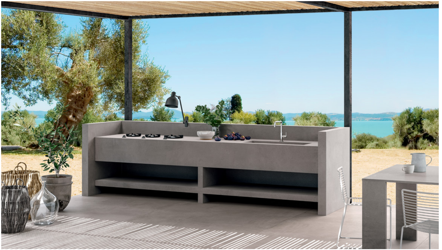
PORTLAND - HOOD (Grey)