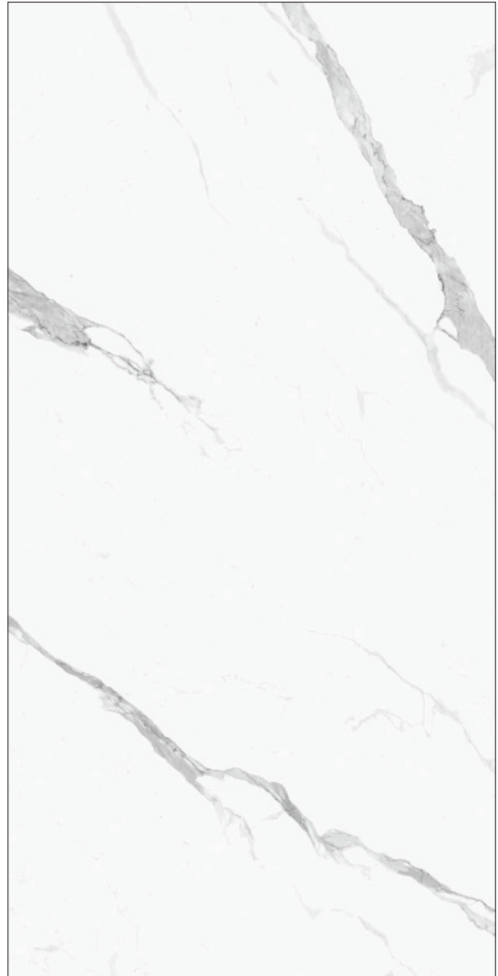
163 x 324 cm (64.17" x 127.56") Polished FD.IN.STT.64X128PL.B

***Please note that Book match A & B are to be sold only as a set.***