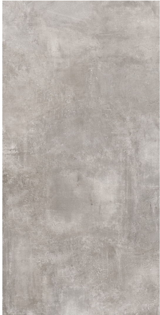
163 x 324 cm (64.17" x 127.56") Matte FD.PL.HOO.64x128.MT

All items shown in this document are part of Olympia's stocking program. For special orders, please contact your Olympia Tile Sales Representative.