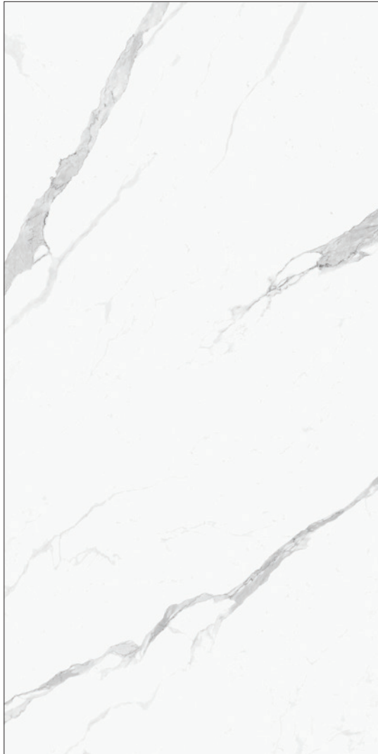
163 x 324 cm (64.17" x 127.56") Polished FD.IN.STT.64X128PL.A