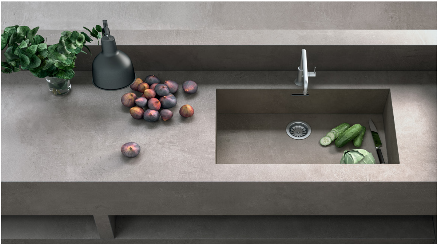
PORTLAND - HOOD (Grey)