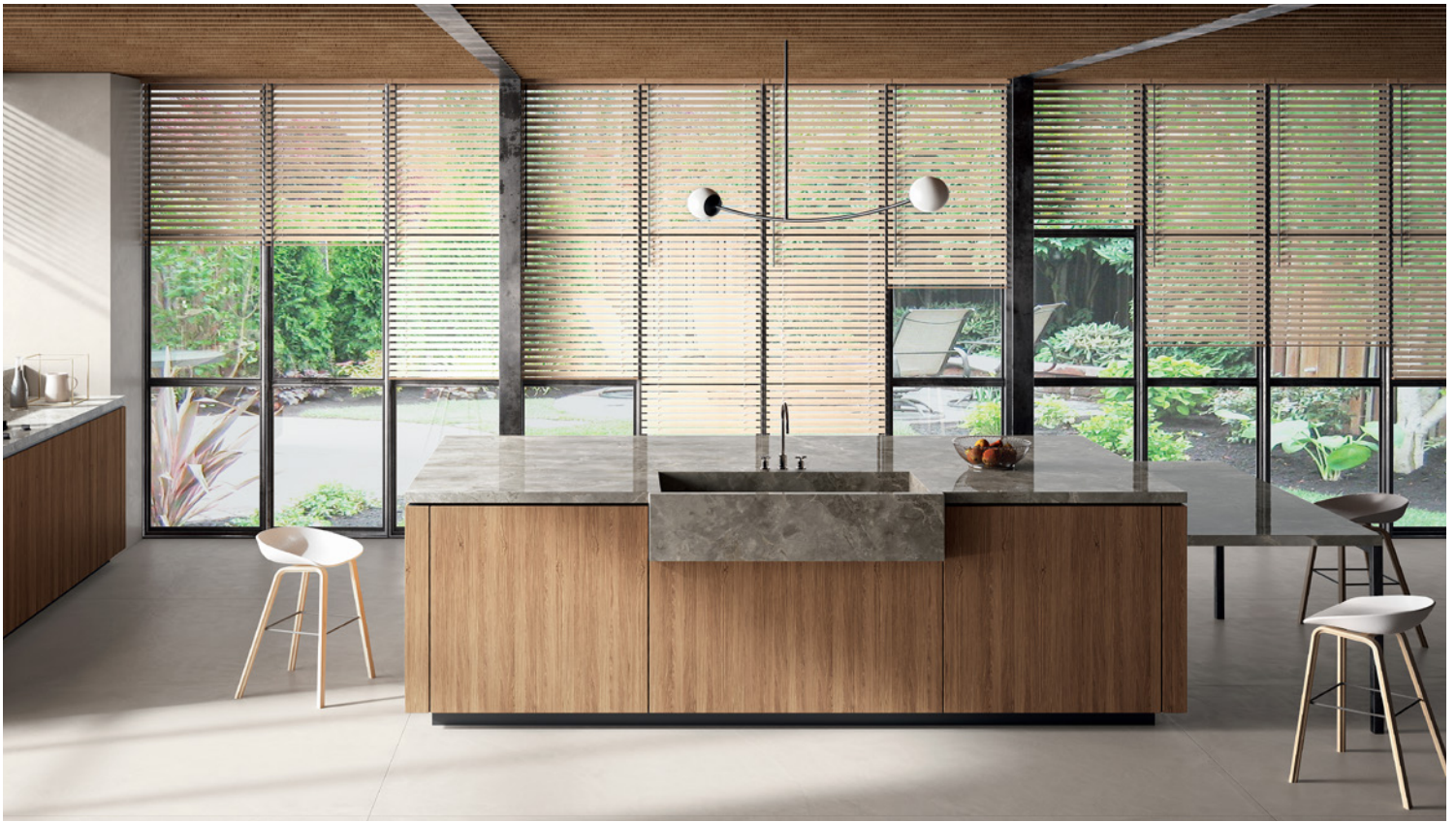
INFINITO - FIOR DI BOSCO (Grey)