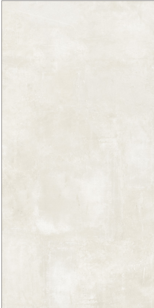
163 x 324 cm (64.17" x 127.56") Matte FD.PL.JRD.64x128.MT