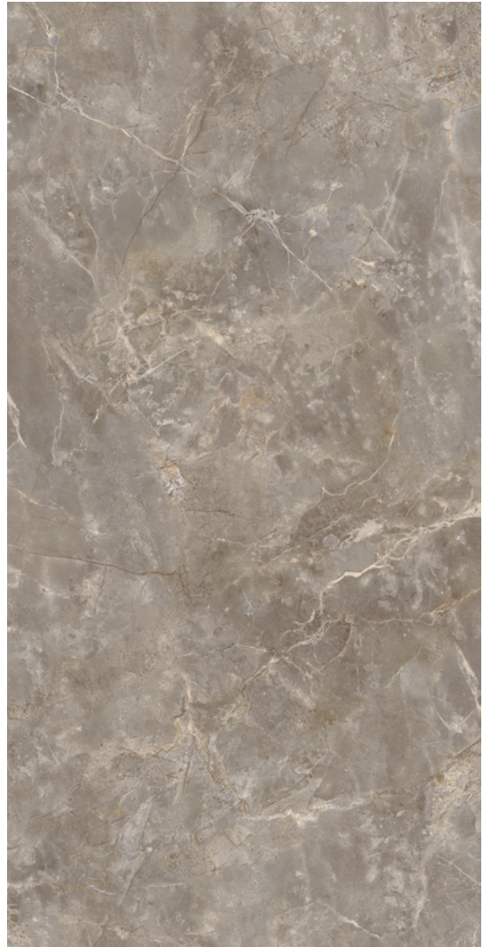
163 x 324 cm (64.17" x 127.56") Polished FD.IN.FDB.64x128.PL

All items shown in this document are part of Olympia's stocking program. For special orders, please contact your Olympia Tile Sales Representative.