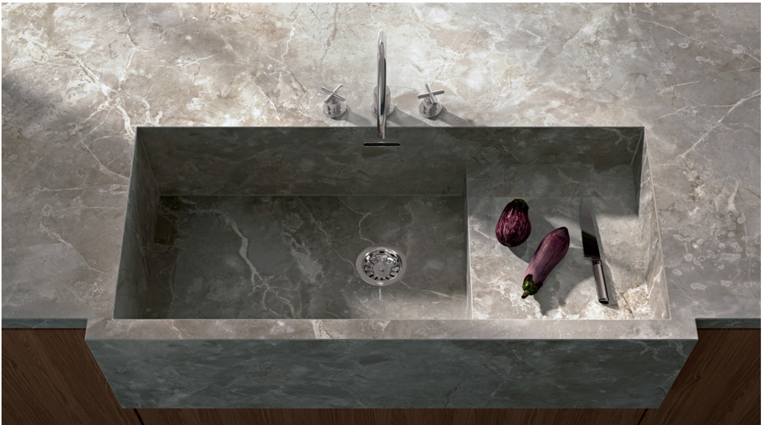
INFINITO - FIOR DI BOSCO (Grey)